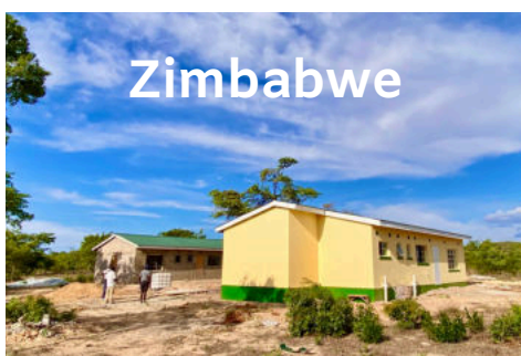
Children's Village Tariro Haven in Zimbabwe

Every day we hear about fates that tear at our hearts - children who have lost their parents and are left alone in this world. They live without protection, without security and often without hope for a better future. With your help, we want to give these children a new perspective.