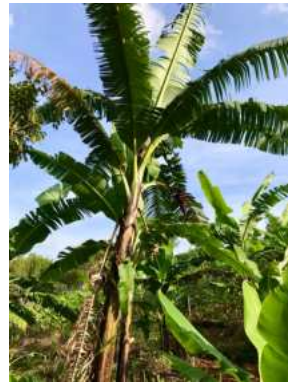
Bananas at an altitude of 1,600 m