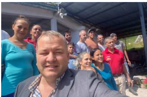
Ein Teil des Teams in Venezuela