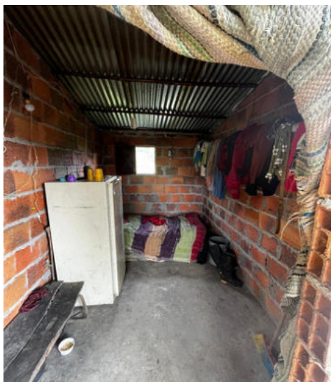
Poverty in the country is widespread.