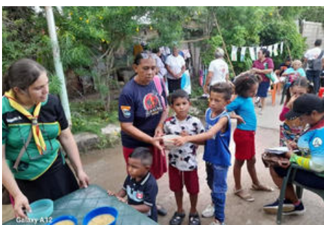
Children's feeding programme in seven federal states

A dedicated local board leads the work on site, and important administrative processes have been initiated so that, following the upcoming registration of L'ESPERANCE International in Venezuela, we will finally be able to purchase the land. This brings the admission of the first children within reach.