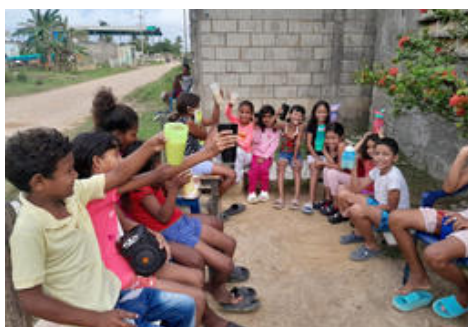
1,200 children across the country received daily meals.