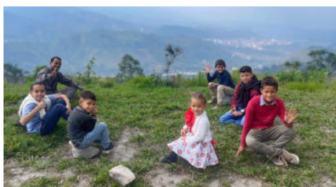
Children on the future children's village site