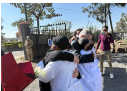
Reunion at the 40th anniversary celebration