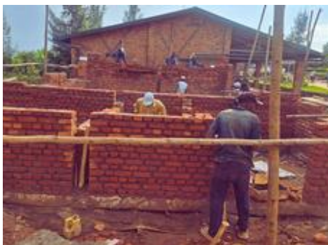
Construction of classroom and lounge

At our agricultural school in Rwanda , we are currently witnessing a remarkable transformation. Together, the teachers, staff, and students have decided to take on increasing responsibility themselves. Instead of waiting for outside help whenever challenges arise, they are seeking their own solutions and actively contributing their skills and talents. As a result, a new boys' dormitory, additional classrooms and common areas, as well as numerous improvements throughout the campus have been completed over the past few months.