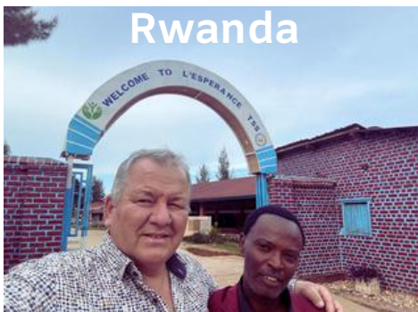
Visiting Rwanda, June 2026

We are especially encouraged that former L'ESPERANCE children in Ethiopia have now established their own association to support one another as adults. It is a wonderful testimony to the fact that the values of unity and Christian love continue to have an impact long after their years in the children's village have come to an end.