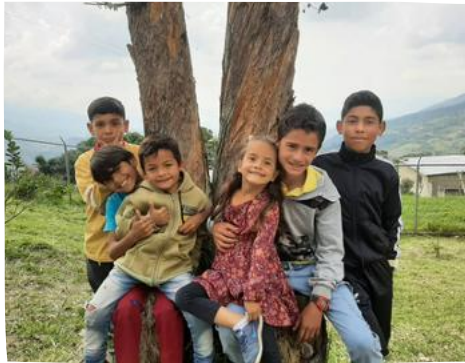
At our campus in Venezuela

The devastating earthquake in Venezuela has deeply saddened us. While the world's attention is gradually fading, the real struggle for survival is only just beginning for many people. Children, in particular, are suffering from the consequences of this disaster. Many have lost their parents or have been separated from their families, increasing the risk of abuse, exploitation, and child trafficking.