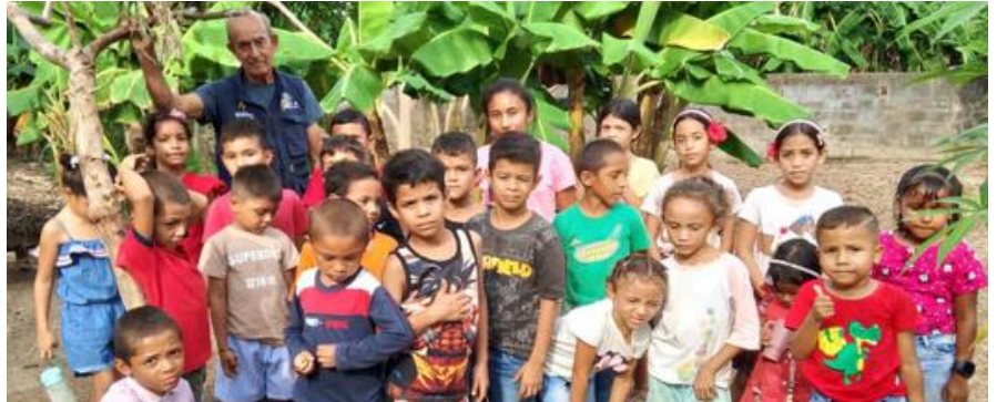
Children's workshop in Guasdálito with our foundation president