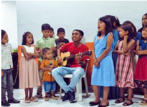
Despite weeks of road blockades, spirits remain high in the children's village.