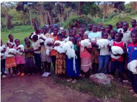
Our new children in Uganda

In Uganda , we were able to welcome many new orphaned children into our care. They now have a safe place to live, receive regular meals, and the opportunity to attend school.