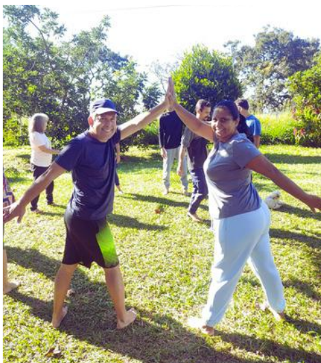
Healthy Living Program

Despite many setbacks, the team on the ground has not given up. Thank you for continuing to carry this project in your hearts.