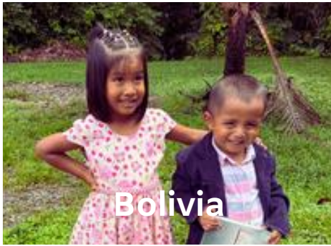
Our Little Ones